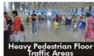
Heavy Pedestrian Floor Traffic Areas