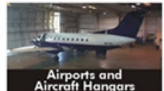
Airports and Aircraft Hangars