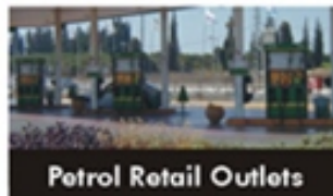
Petrol Retail Outlets