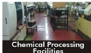
Chemical Processing Facilities