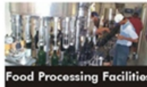
Food Processing Facilities