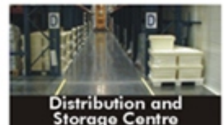
Distribution and Storage Centre