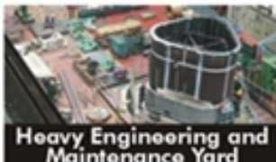
Heavy Engineering and Maintenance Yard