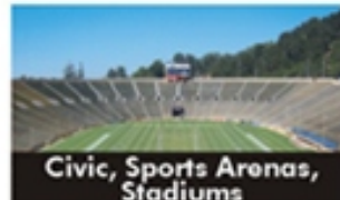
Civic, Sports Arenas, Stadiums